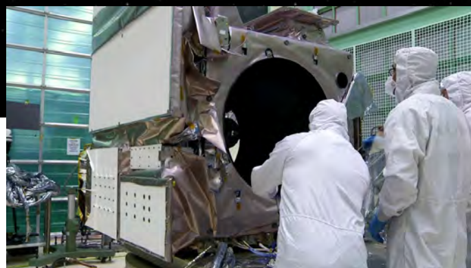
Engineers work on ATLAS in the clean room at NASA's Goddard Space Flight Center, Greenbelt, Maryland

Spacecraft Dimensions: 12.5 feet tall with an 8.2-foot-by-6.2-foot base when stowed for launch to fit within the rocket fairing. This is about the size of a small camper trailer. After separation from the launch vehicle, the solar array extends, which increases the 6.2-foot dimension to 32.8 feet.